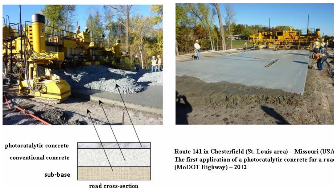
Figure 3. Two-lift technology for paving.

This project was officially presented in occasion of the national two-lift concrete paving open house, hosted by the National Concrete Pavement Technology Center (NCPTC) in Chesterfield, MO - USA (September 2010). This experimental road was constructed in October 2011 (Figure 3) and the monitoring campaign lasted for one year at least, the pervious shoulders were constructed in May 2012.