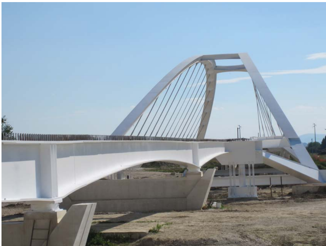
Figure 1 - Newly built bridge with concrete piles made using photocatalytic cement.

The development of innovative, sustainable technologies for the environmental improvement is an absolute need. In this sense, photocatalytic cements represent a significant contribution which can be widely implemented in the construction industry (Figure 1). Many research activities are currently conducted on photocatalysis applied to the building industry and cement based solutions represent the largest market in terms of volumes already applied.