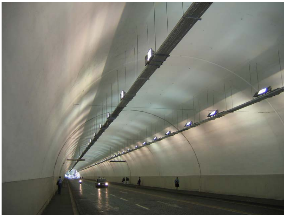
Figure 4. Application of photocatalytic coating to the internal surface of a tunnel.

The same advantages can be obtained by applying photocatalytic coatings, whose effect is activated by dedicated UV lighting systems. Smoothing cement-based coats, containing photoactive \text{TiO}_2 , can be effectively applied as final sprayed coating for wide vertical as well as horizontal surfaces, like walls, ceilings, tunnel vaults and multi-storey car parking. Photocatalytically activated, they show anti-pollution, bacteriostatic, anti-mold and auto-cleaning properties, allowing clean surfaces for longer.